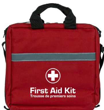
Soft Pack Red Bag 23 x 32 x 10cm